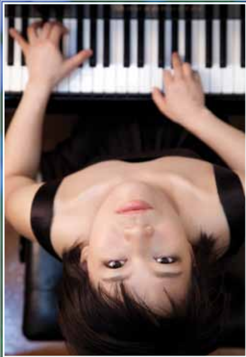
Ching-Yun Hu, piano